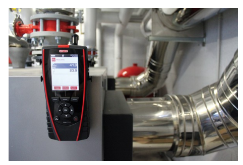
Climatic conditions measurement

AMI 310 PRF: portable instrument supplied with a ±500 Pa pressure module, a Ø6 mm T Pitot tube, 2 x 1 m of silicone tube, a stainless steel tip, a wireless stainless steel hygrometry probe, a telescopic hotwire probe and a Ø100 mm vane probe