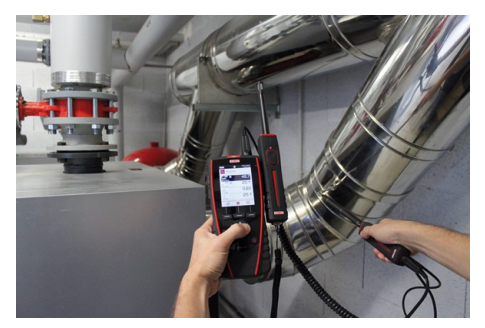
Hygrometry and air velocity measurement